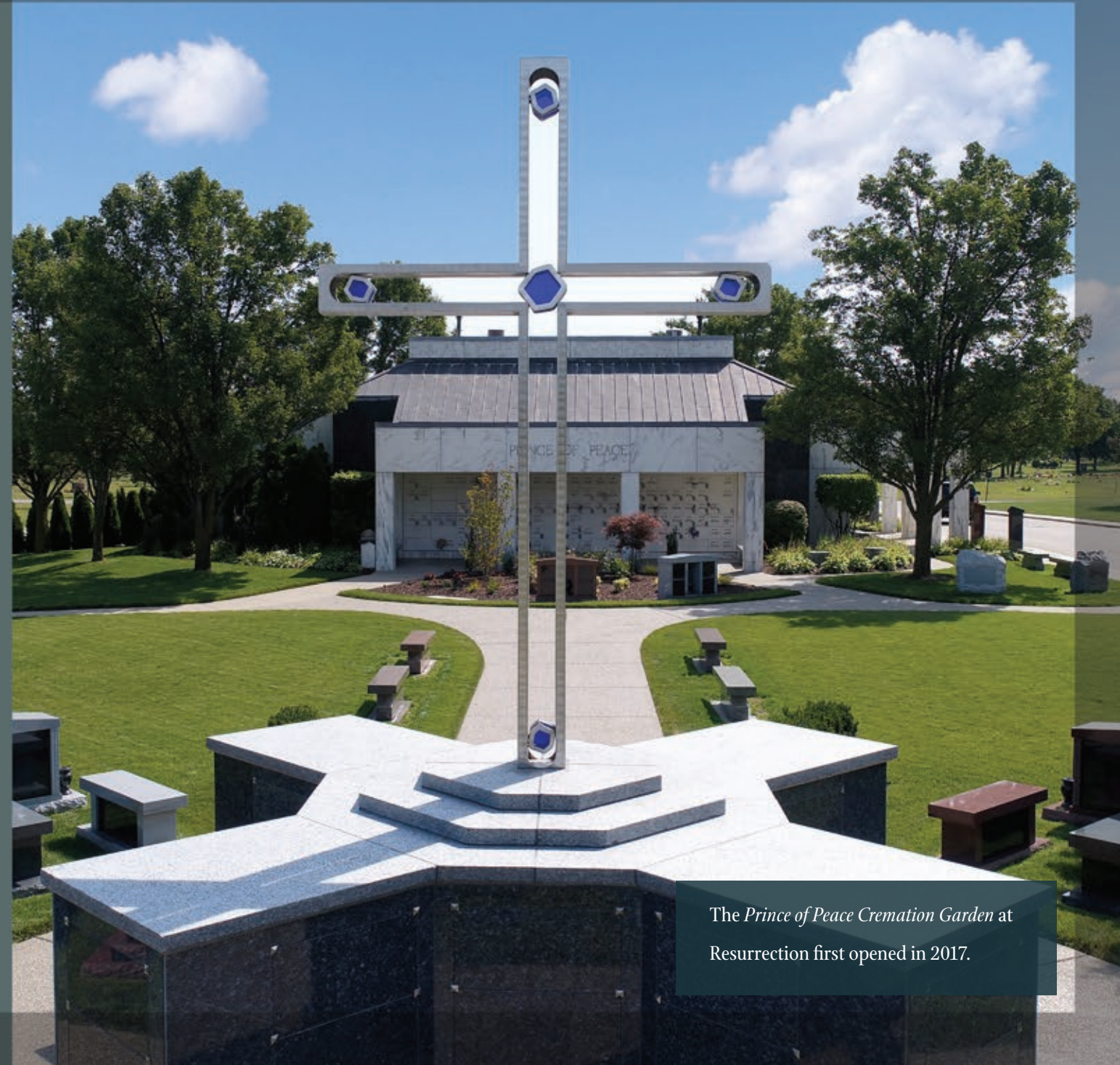
The Prince of Peace Cremation Garden at Resurrection first opened in 2017.

There are many options available with cremation that allow you to select a memorialization that is the right fit, including cremation boulders, benches and memorials of different designs.