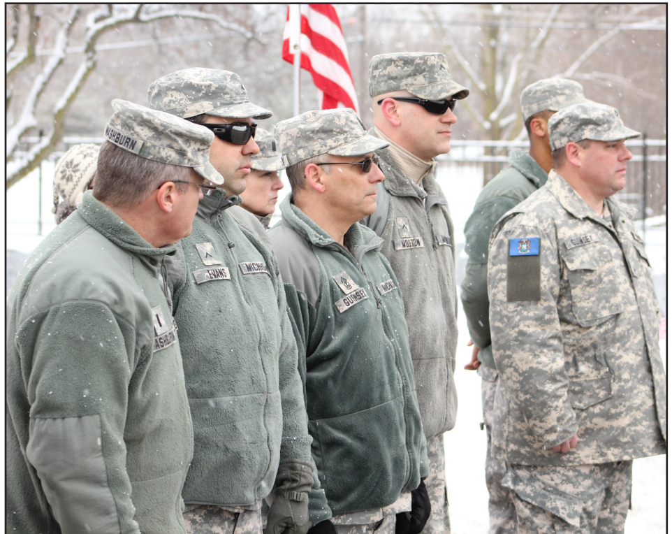
Veterans and current members of the U.S. Military and National Guard have attended our past Wreaths Across America events.

Please check our website at www.mtelliott.com for updates.